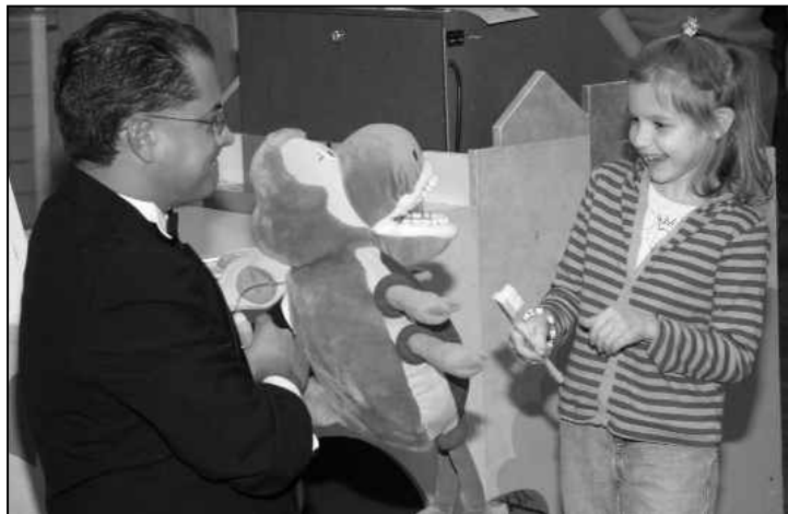
Above: Children enjoying a visit from the Tooth Fairy. It's not everyday the Tooth Fairy comes to the Scranton Public Children's Library!