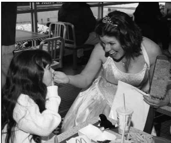
Bottom Left: The Tooth Fairy shares her story with an interested child.