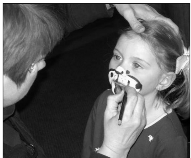
A little library visitor gets her face painted by a member of Happy Faces face painting team.