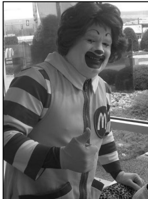
Left: Ronald McDonald makes an appearance every year during NCDHM.

NCDHM is a huge undertaking that requires many volunteers. Please plan on helping in any way you can... whether it's speaking at a local school or attending the events. We look forward to your participation.