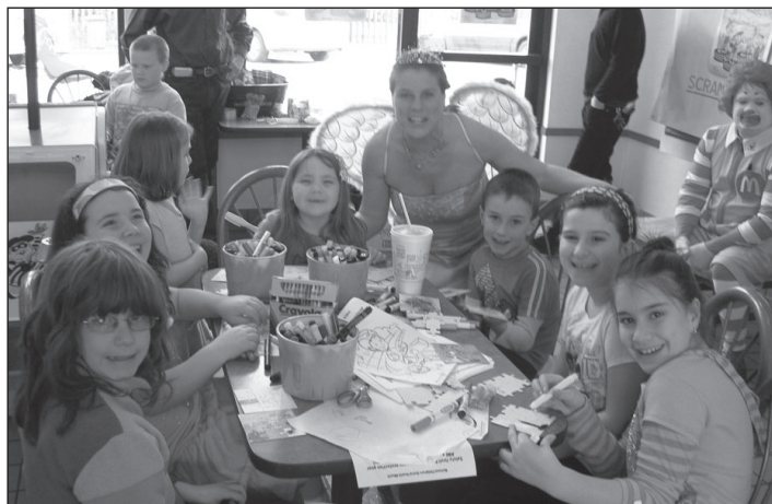
The children have a great time making creations with the Tooth Fairy and Ronald.