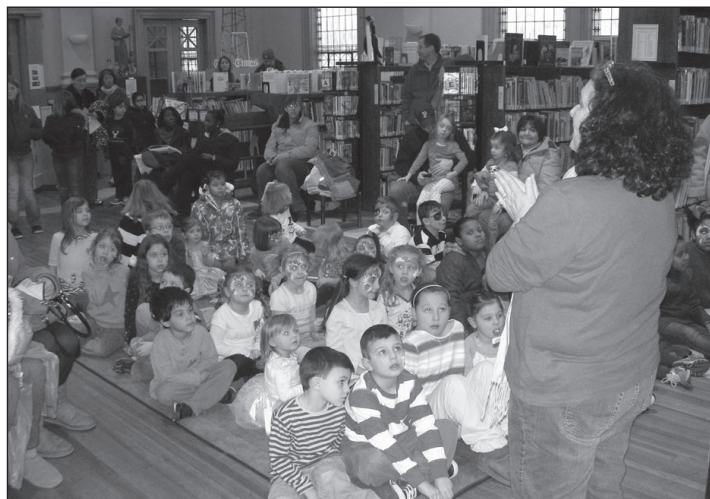
A crowd of 75 kids gather at the Scranton Children's Library.