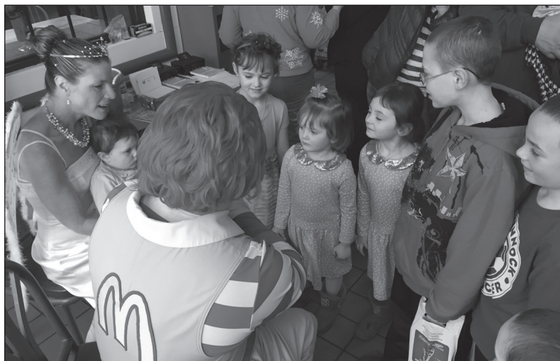
Ronald McDonald and The Tooth Fairy entertain children all day long.