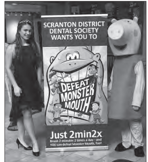
The Tooth Fairy and Peppa Pig are on hand at the Mall to greet the children.